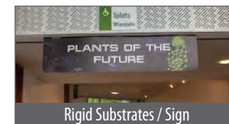
Rigid Substrates / Sign