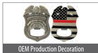
OEM Production Decoration