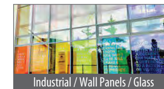
Industrial / Wall Panels / Glass