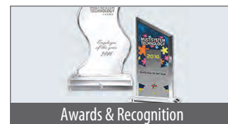
Awards & Recognition