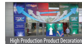
High Production Product Decoration