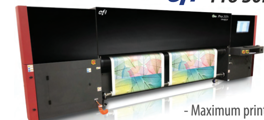
efi Pro 30h