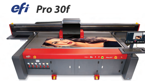
efi Pro 30f

EFI is an important part of the ITNH portfolio as it is the perfect path for growing production requirements for large format and industrial printing needs. Featuring both "true-flatbed" and "hybrid - roll/rigid substrate" printing technology, EFI blends high print quality with higher production at an affordable price.