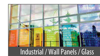
Industrial / Wall Panels / Glass