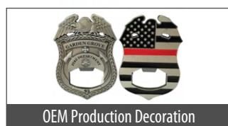
OEM Production Decoration