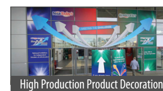
High Production Product Decoration