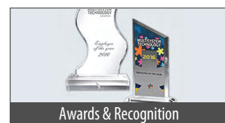
Awards & Recognition