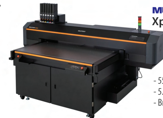
MUTOH XpertJet 1462UF