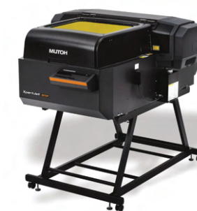
MUTOH XpertJet 661UF

Mutoh has stormed into the UV Flatbed market in recent years. Now on their 3rd generation of technology, Mutoh offers two great small format UV flatbed printers that are most well-known for high quality and efficient printing of ADA/Raised Letter signage.