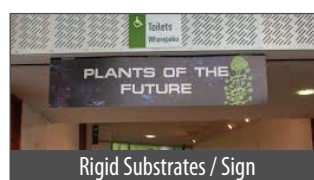
Rigid Substrates / Sign

ITNH has carefully created this portfolio of printers to ensure that you get the best possible fit for your needs. Our selection allows our customers to get their printing operations started and grow quickly. Other key ITNH advantages include: