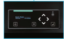
LED touch panel