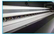
High Precision Aluminum Rail Mechanism