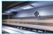
Internal LED lighting