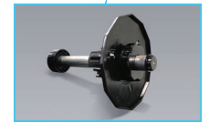
New media feed flange