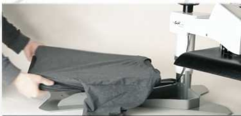
Dress / Thread from the back (Shirts right-side up!)

Our exclusive SuperCoil-Microwinding™ heater technology guarantees perfect uniform heat to the edge - outperforming and out heating all others, with Lifetime Warranty!