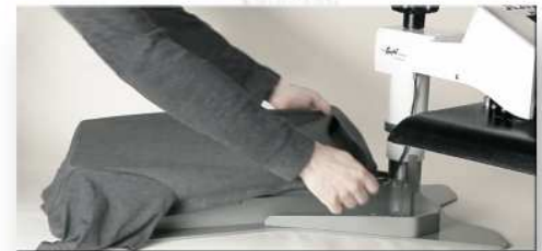
Dress / Thread from the Front (Screenprint style Quick-load)

ALL-Thread™ bottom tables allow for dressing garments, bags, and other hard-to-press bulky products around the table. Instantly interchangeable sleeve, youth, bag platens, & custom sizes are available!