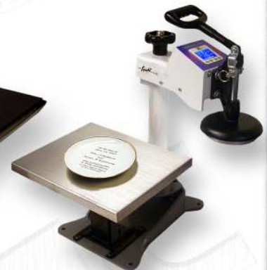
Plates / Custom